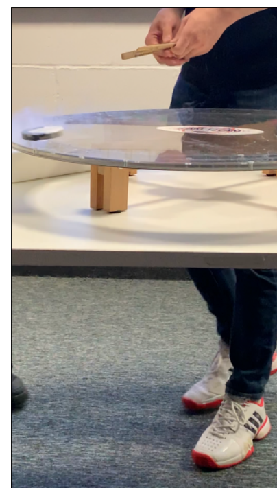
A superconducting puck, cooled by liquid nitrogen, floats above a ring of magnets.