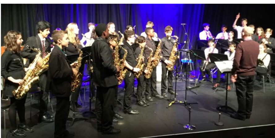
Massed Jazz Band Rehearsal