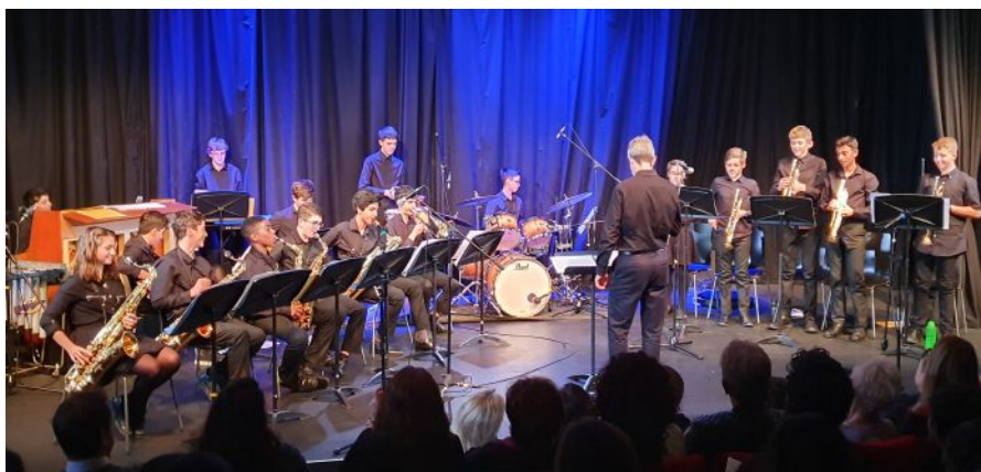
Junior Big Band