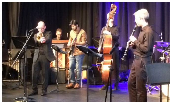
Music Staff Jazz Ensemble