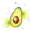
Illustration Project Drawings of everyday items. Exploring the works of illustrators such as Emma Dibben and Andrew Joyce

analysing art: mood, form, content, process using subject specific language